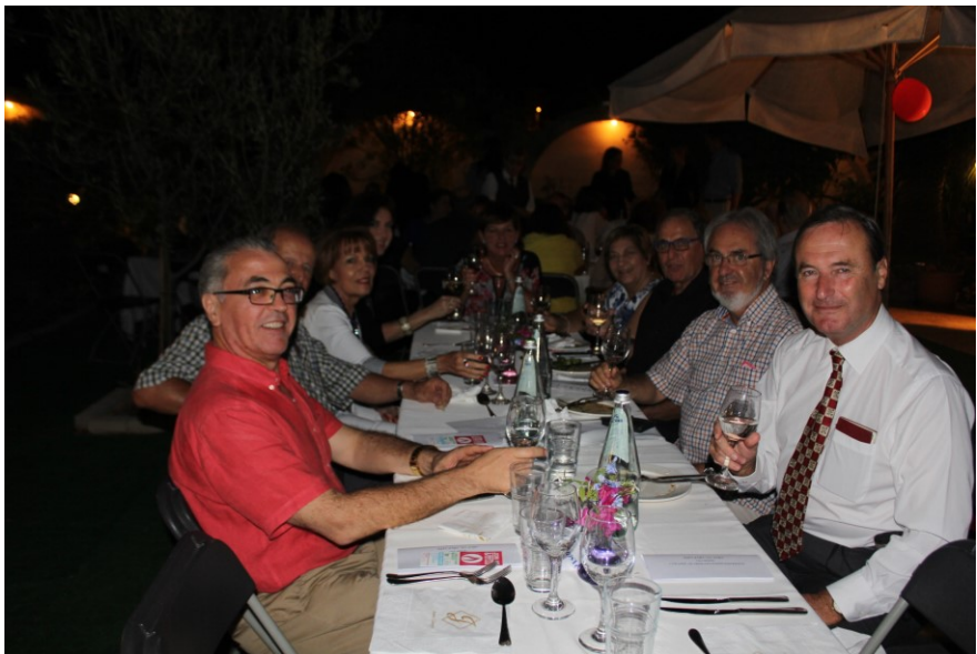
Guests enjoying the evening

Life Network Foundation Malta would like to thank everyone who came along and made it such a special evening. Special thanks also go to all who were involved in the organisation of this event and all who helped make this event possible. Let us hope that this will be the first of many such events in aid of a very worthy cause.