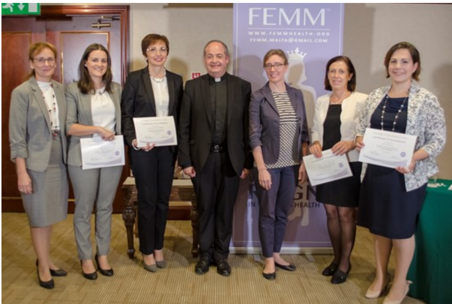
FEMM graduation at the Excelsior Hotel

FEMM enables medical providers to diagnose and treat ovulatory dysfunction (symptoms of which include acne, pain, weight gain, depression, migraines, PMS), infertility and menopause, rather than manage or suppress symptoms.