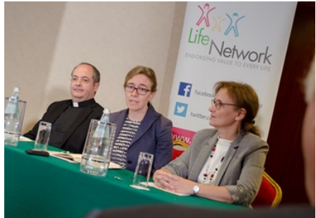
Speakers at the graduation ceremony

Interested parties can contact us on femm.malta@gmail.com to learn about FEMM, ask for lectures or be referred to a local FEMM physician.